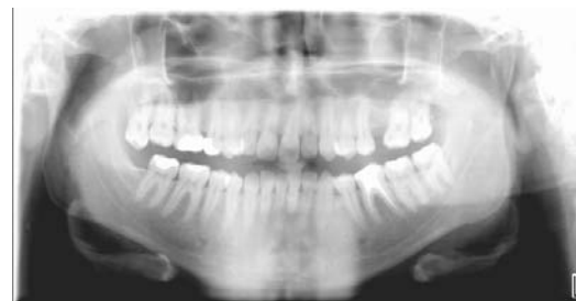
Figure 1 : (A) film-based panoramic radiograph, (B): digital panoramic radiograph.